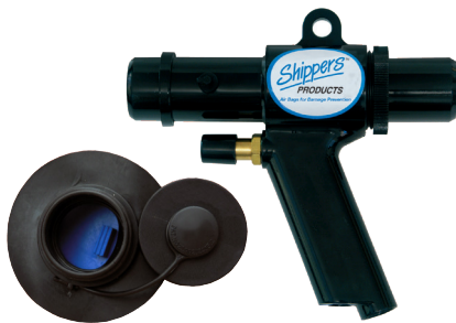
SuperFlow Inflator and valves for use with our Flex Airbags